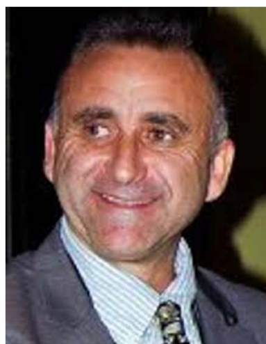
Edmundo Tovar Education Society