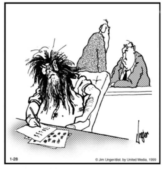
"They said he wasn't to leave the office 'til the L50 balanced."

I can report that it is expected that the financial reporting for all Region 8 Sections has now been completed; albeit not until August. I am asking for the support of the Region 8 Committee members that for this year all reporting will be completed to time.