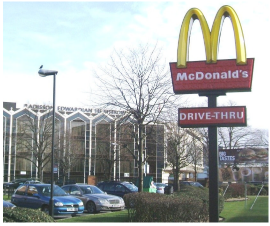
A view the Radisson may not want you to see