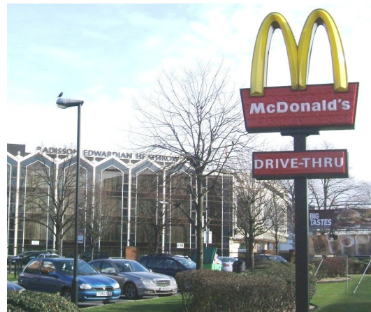
A view the Radisson may not want you to see