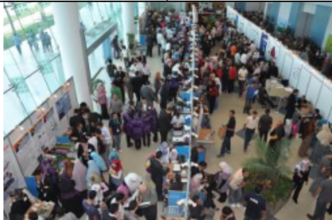
Egyptian Engineering Day 2010