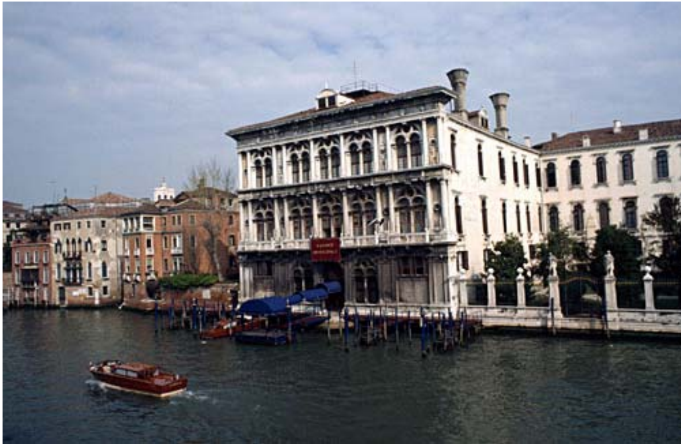
Palazzo Vendramin (1480), home to our Social dinner