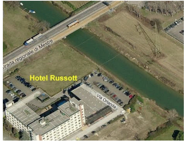
Route from bus stop across iron bridge, and along the road to Hotel Russott.