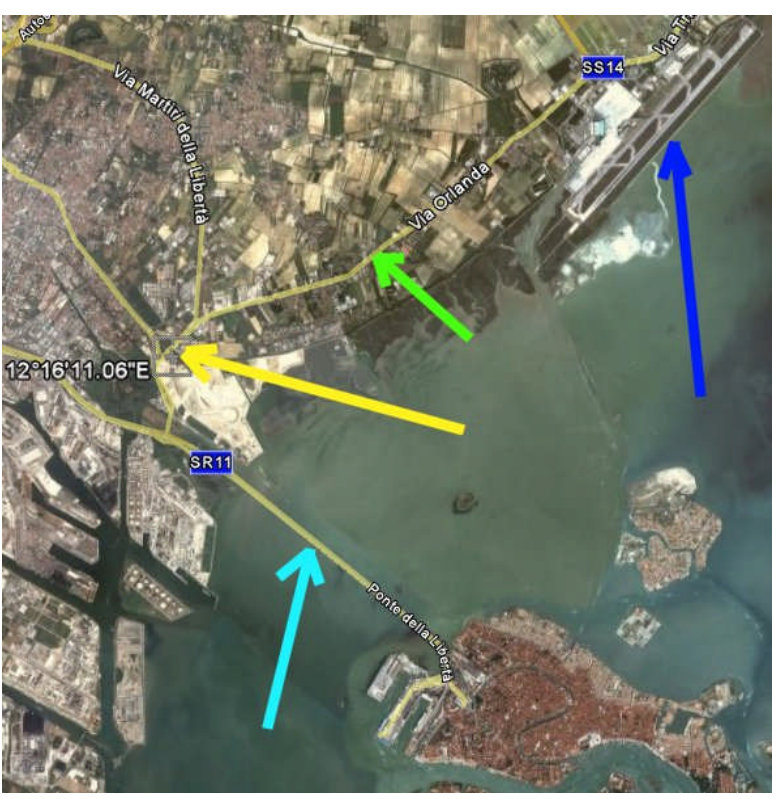
Hotel location: yellow arrow Airport: dark blue arrow