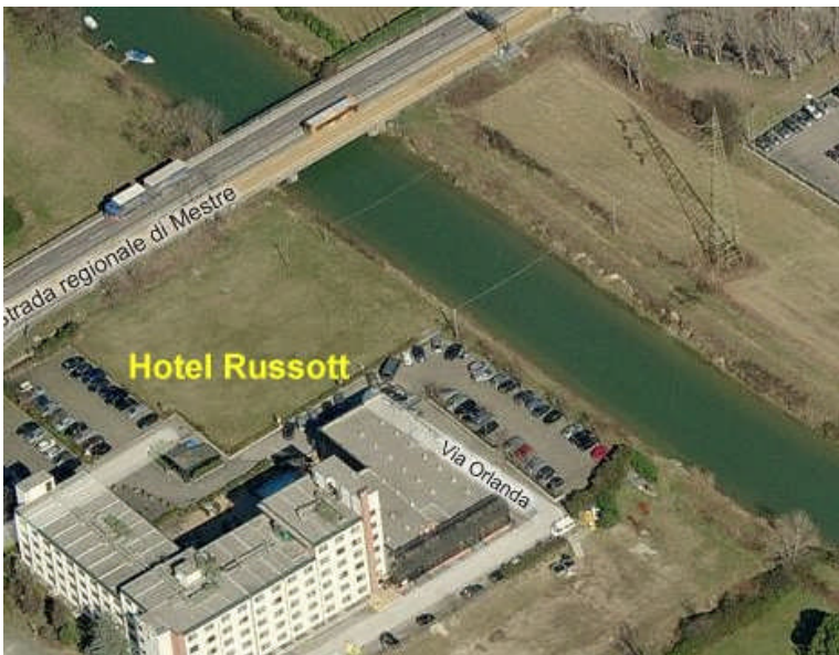
Route from bus stop across iron bridge, and along the road to Hotel Russott.