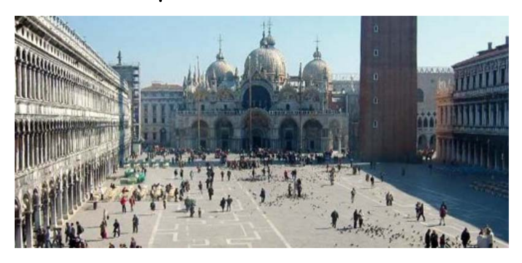
shall we spend words to describe Venice?