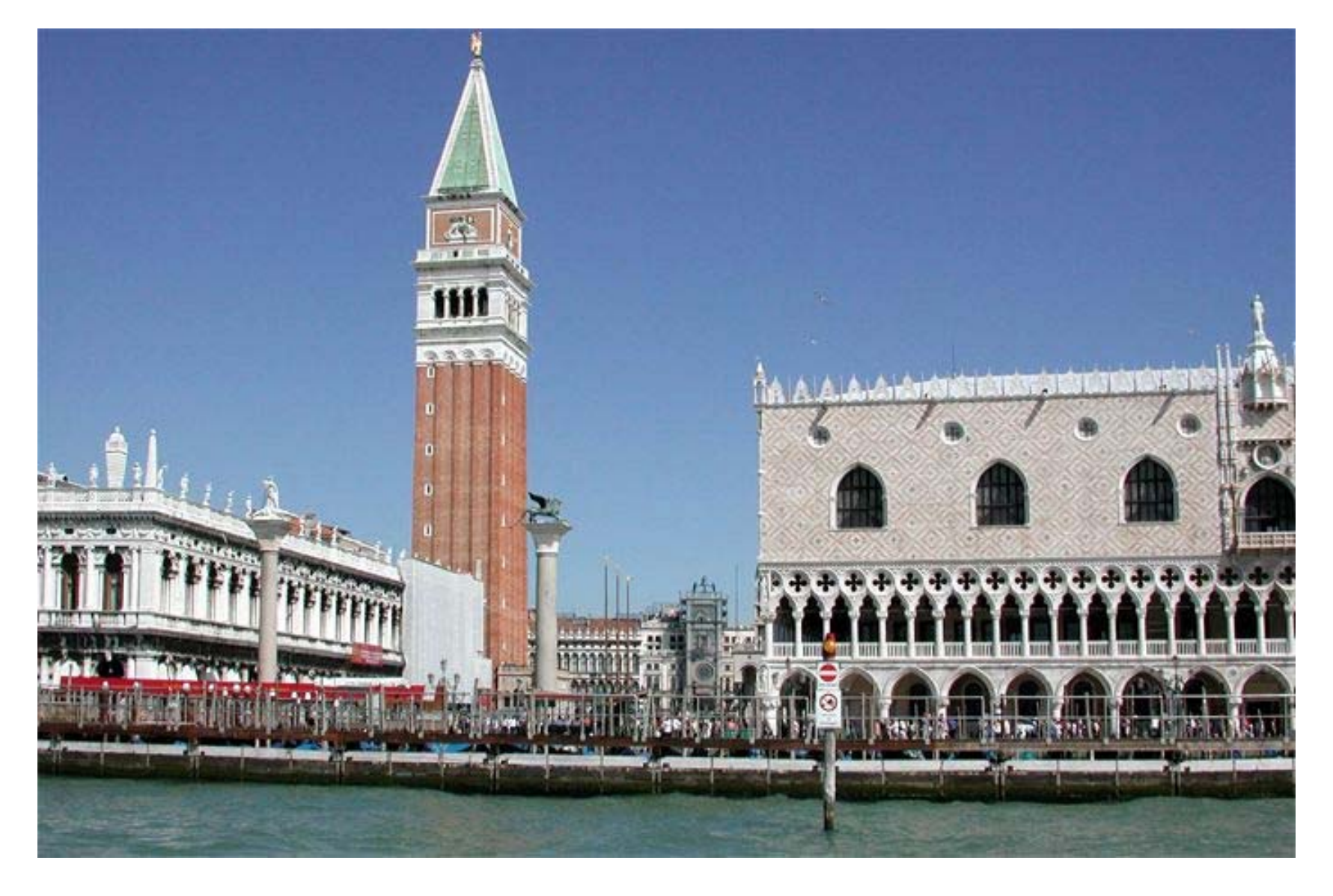
most famous spot: Piazza San Marco