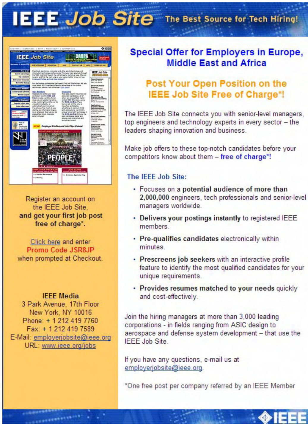
Figure 2. IEEE Region 8 Job site promo