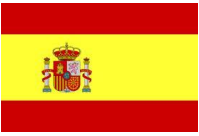
Flag of Spain