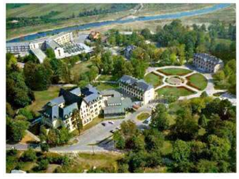
Hotel address HOTEL HOLLYWOOD, Dr. Mustafe Pintola 23, Ilidža, 71000 Sarajevo, Bosnia and Herzegovina

For anyone arriving by car, the hotel has a garage and parking is free for the guests.