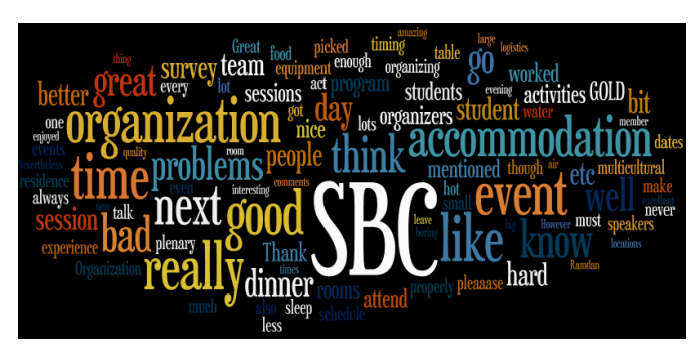
Figure 1Comments in a survey about the Madrid SBC

During the application process there is a first deadline to submit a simple application where the student branch expresses its wish to organize the Congress and explains only general ideas. After this first round, where least favorable applications are declined, the rest of the applying student branches have to prepare a second and much more extended application to submit in a second deadline, usually two months after the first one.