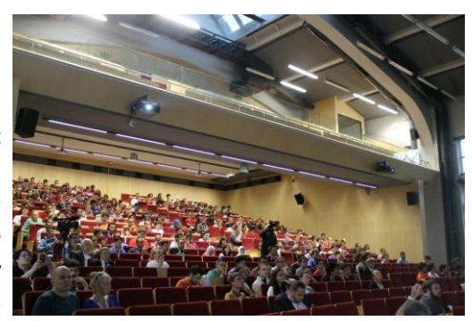
Figure 7 Plenary session in Krakow

Due to the big number of attendees, and since most rooms in the university or the selected location have a capacity of about 30 people, it is necessary to organize parallel tracks, which consist of workshops that take place simultaneously in different rooms so every participant can attend a workshop. It is also advisable to repeat some of the workshops in consecutive slots, since there might be interesting topics that many participants might want to attend.