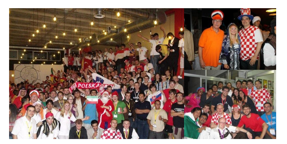
Figure 10 Multicultural evenings in Leuven, Madrid and Krakow