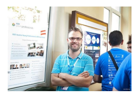
Figure 11 Poster session in Krakow

Both events need an open hall or corridors to set the booths and the posters on the walls.