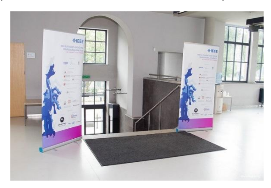
Figure 13 Photocall in Krakow

Preparing a Photocall for pictures and using it as a background in the plenary sessions is always a good idea, also in order to give sponsors and the event itself more visibility.