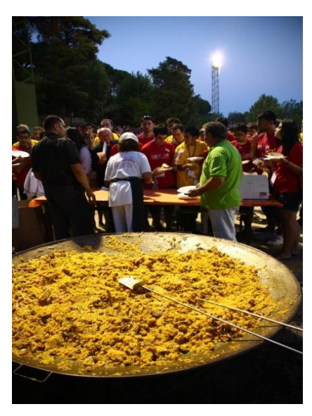
Figure 9 Paella instead of BBQ in Madrid

It is an event where every attendee shares food, drinks, music and traditional dress from their countries. It must be an open and well ventilated place, since spicy food, *not only* soft drinks and regional dances usually increase the temperature and it should be remembered as an awesome experience where nobody fainted from the heat or lack of fresh air!