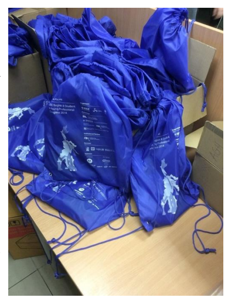
Figure 12 Welcome Pack in Krakow

It is always interesting preparing a "survival guide" that might be put on the website and printed in order to distribute it to participants. It should contain everything that could be useful for them during their stay, like accommodation, meals, timetables, directions... something like this would be very useful not only for attendees but also for the organizing committee, who will avoid being repeatedly asked the same questions every time.