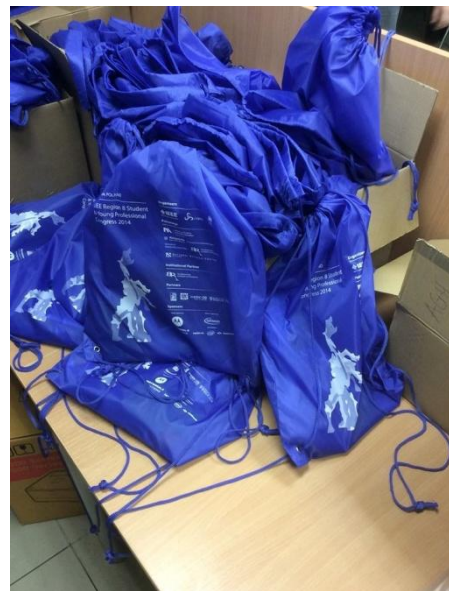
Figure 12 Welcome Pack in Krakow

Regarding the room distribution, it is advised to make a rough planning. Notice that there will have to keep separate floors by genders and in some cases different Sections as well. It is called a "rough