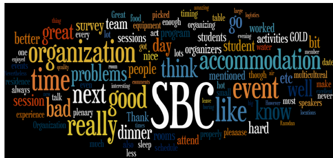
Figure 1 Comments in a survey about the Madrid SBC

During the application process there is a first deadline to submit a simple application where the student branch expresses its wish to organize the Congress and explains only general ideas. After this first round, where least favorable applications are declined, the rest of the applying student branches have to prepare a second and much more extended application to submit in a second deadline, usually two months after the first one.