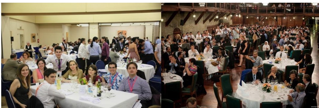
Figure 8 Gala dinners in Madrid and Krakow

Usually it has an Awards ceremony, so audio equipment and a stage must be available.