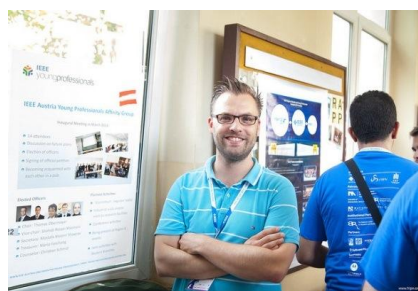
Figure 11 Poster session in Krakow

Both events need an open hall or corridors to set the booths and the posters on the walls.