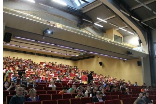
Figure 7 Plenary session in Krakow

Due to the big number of attendees, and since most rooms in the university or the selected location have a capacity of about 30 people, it is necessary to organize parallel tracks, which consist of workshops that take place simultaneously in different rooms so every participant can attend a workshop. It is also advisable to repeat some of the workshops in consecutive slots, since there might be interesting topics that many participants might want to attend.