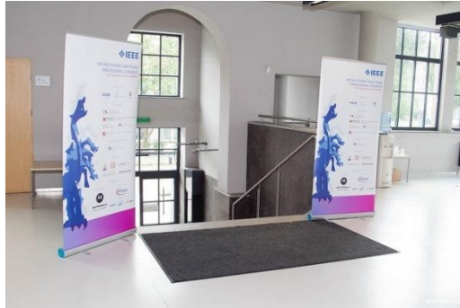
Figure 13 Photocall in Krakow

Preparing a Photocall for pictures and using it as a background in the plenary sessions is always a good idea, also in order to give sponsors and the event itself more visibility.