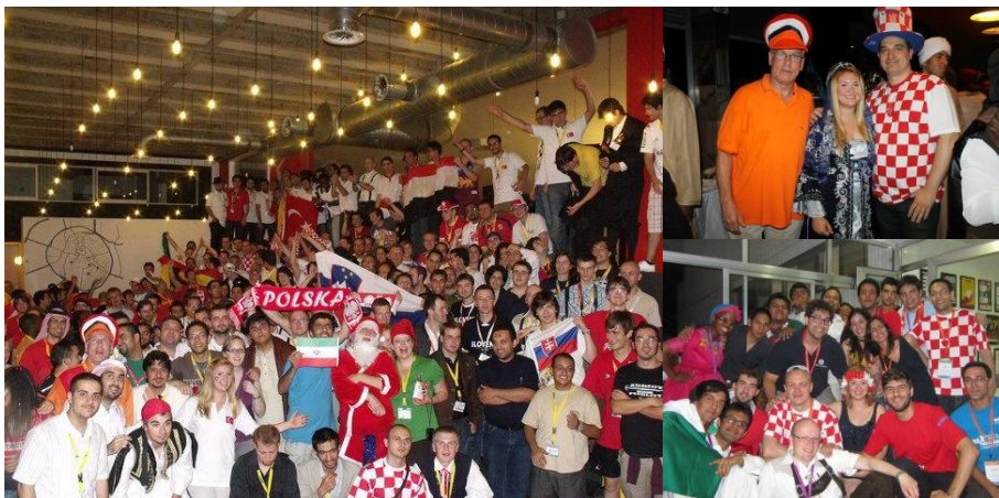
Figure 10 Multicultural evenings in Leuven, Madrid and Krakow