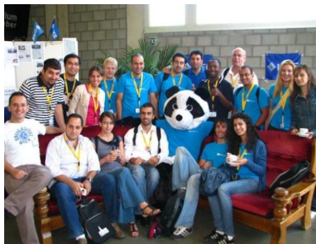
Figure 14 Leuven attendees with Congress' pet

Other leisure ideas are “Funny Picture contest”, the “Gossip box”, Congress’ pet, etc... It is up to organizers, but it allows time for entertaining as well.