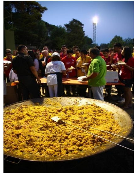
Figure 9 Paella instead of BBQ in Madrid

It is an event where every attendee shares food, drinks, music and traditional dress from their countries. It must be an open and well ventilated place, since spicy food, *not only* soft drinks and regional dances usually increase the temperature and it should be remembered as an awesome experience where nobody fainted from the heat or lack of fresh air!