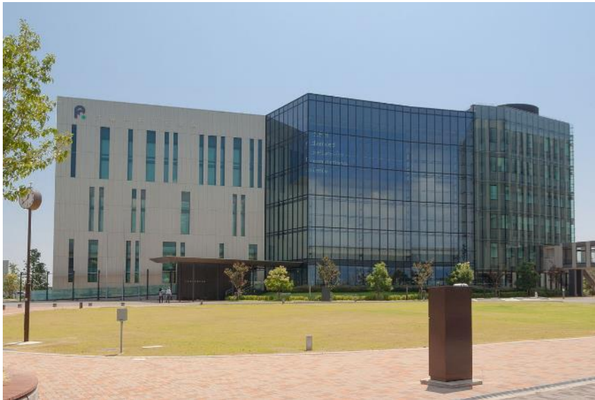
RIKEN Advanced Institute for Computational Science located in front of the conference venue