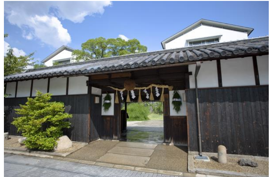
KOBE SHU-SHIN-KAN BREWERY

http://enjoyfukuju.com/english/our_sake/index.html