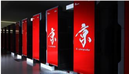
The K Computer