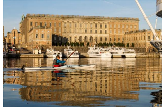
Stockholm daylife