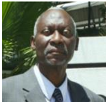
Dig Once Bai Blyden