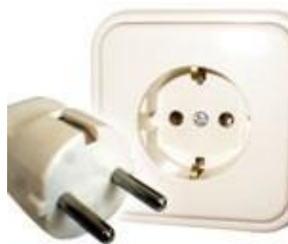
Figure 1: On the left, Type C: this socket also works with plug E and F Type. On the right, F Type: this socket also works with plug C and E.