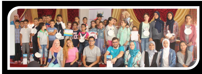
Fig. 4. Junior Event