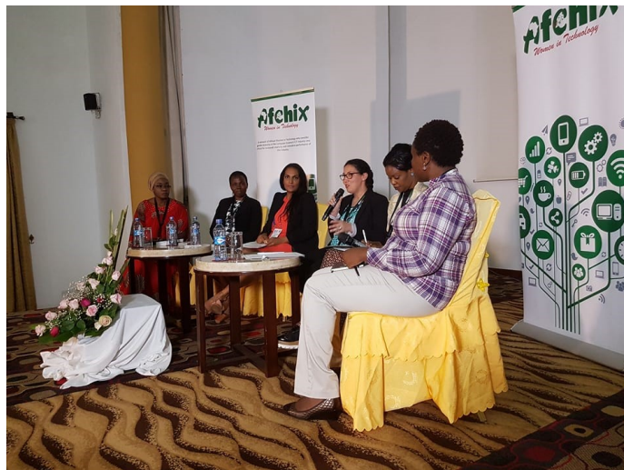
Fig. 5. WiE In Africa