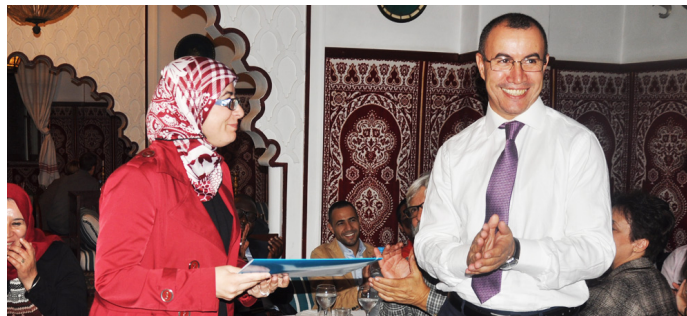
Fig. 3. Award Program