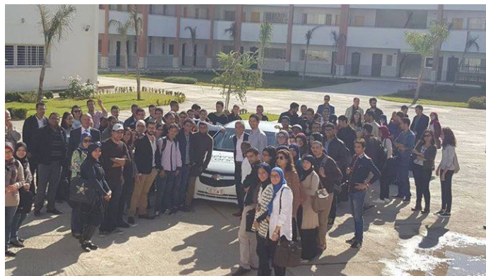
Fig. 1. Smart Car