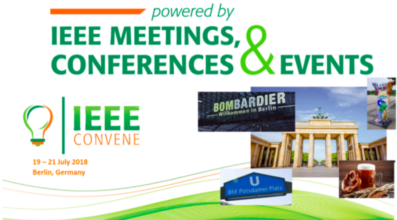
Fig. 4. IEEE Convene