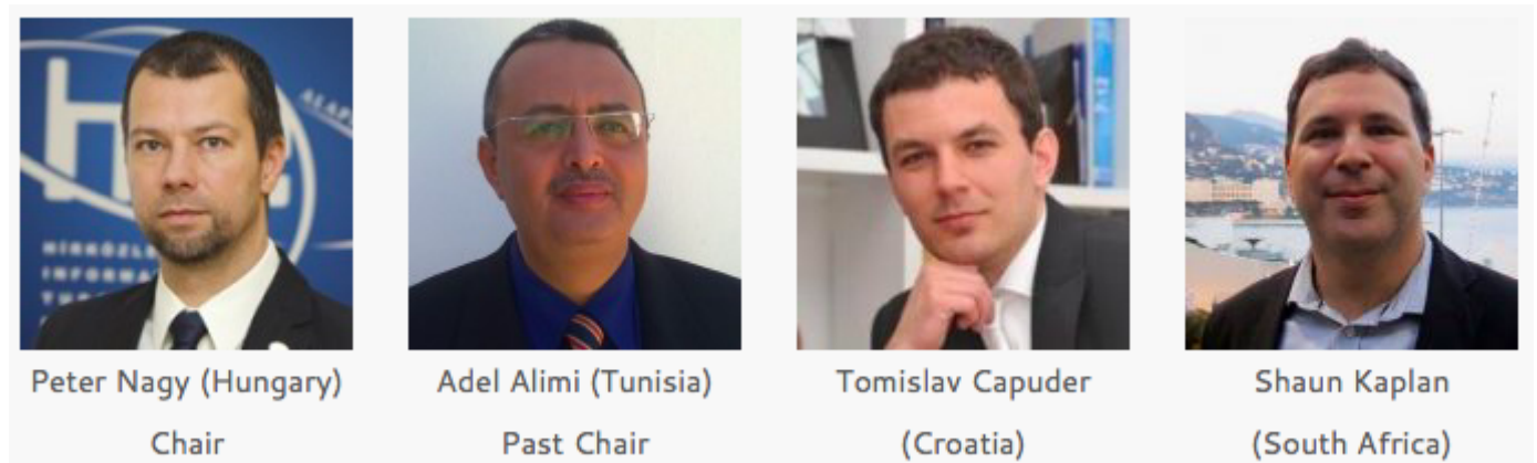
Fig. 1. Conference Coordination Subcommittee members