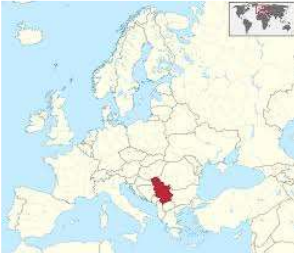
Serbia on the map of Europe