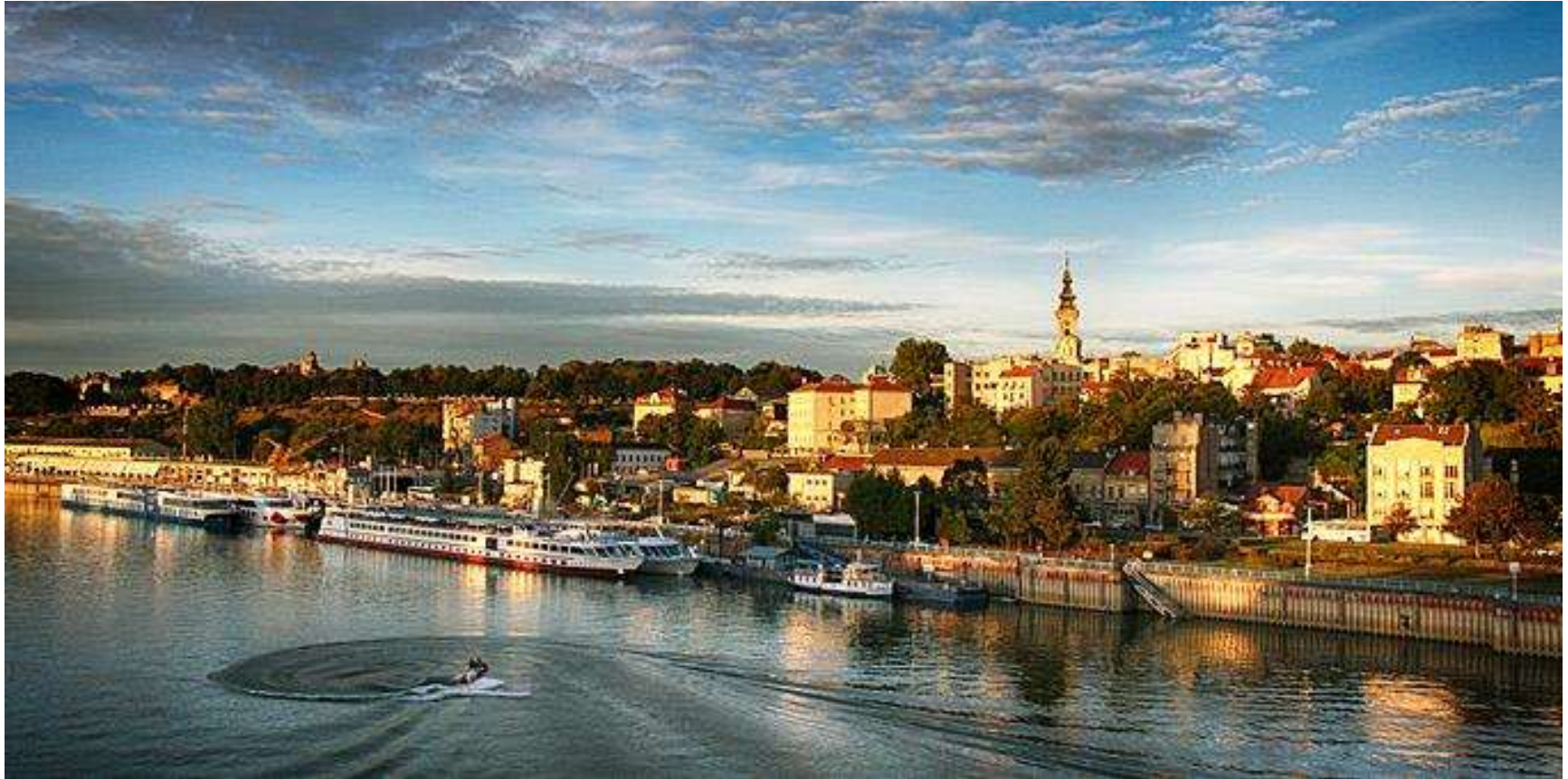
A view of Belgrade city