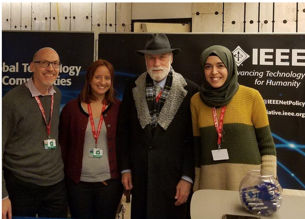
Vint Cerf discussing TAWASOL project with IEEE fellows at #IGF2017