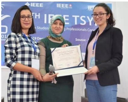
3 rd winner