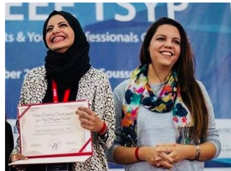
1 st winner