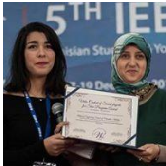
2 nd winner