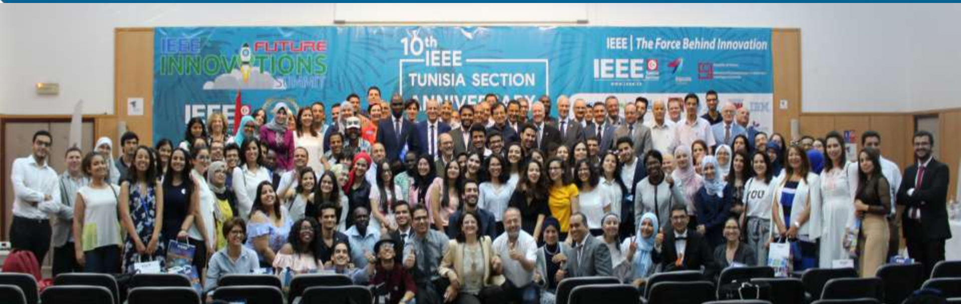
Photo speak-Innovation Summit and 10 th Year anniversary celebration of Tunisia Section