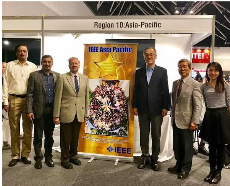
Asia Pacific 50 th Anniversary History Book Editorial Team