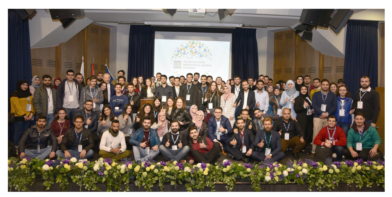
Lebanon Section IEEE National Day 2019