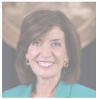
Kathy Hochul Lieutenant Governor, New York