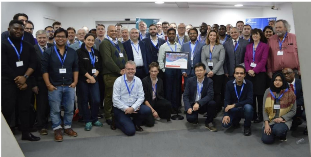
Blockchain Group Launch 24 th February- London Met University – Group photo