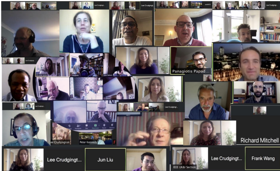
21 one-to-one meetings with Chapter Chairs - June 2020