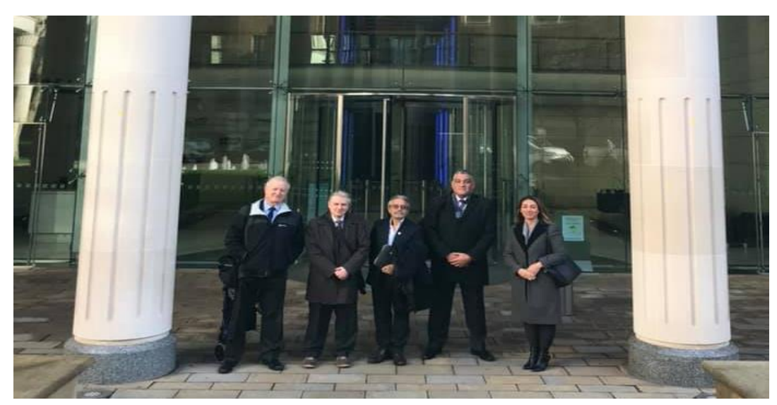
Industry Delivery discussion with Engineering council (Jan 2020)