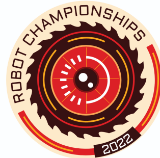
IEEE REGION 8 MALTA

The event will happen in Malta in Autumn 2022 over two days. The main competitions will be held on the second day. The dates will be published later on during the second quarter of 2022. Applications will be open on April 1st 2022 till June 1st 2022 end of day CET time. Student branches can support a team of three to apply and compete in Malta in 4 games. More information will be available here: www.ieeemalta.org/robotchampionship