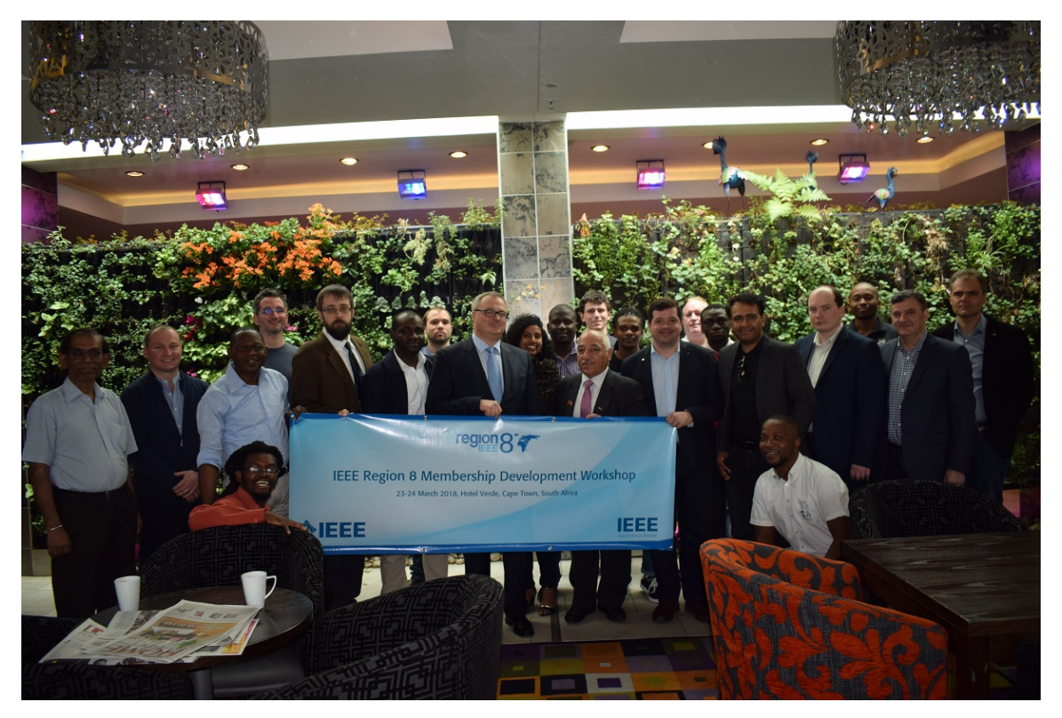
IEEE R8 MDW 2018, Cape Town, South Africa