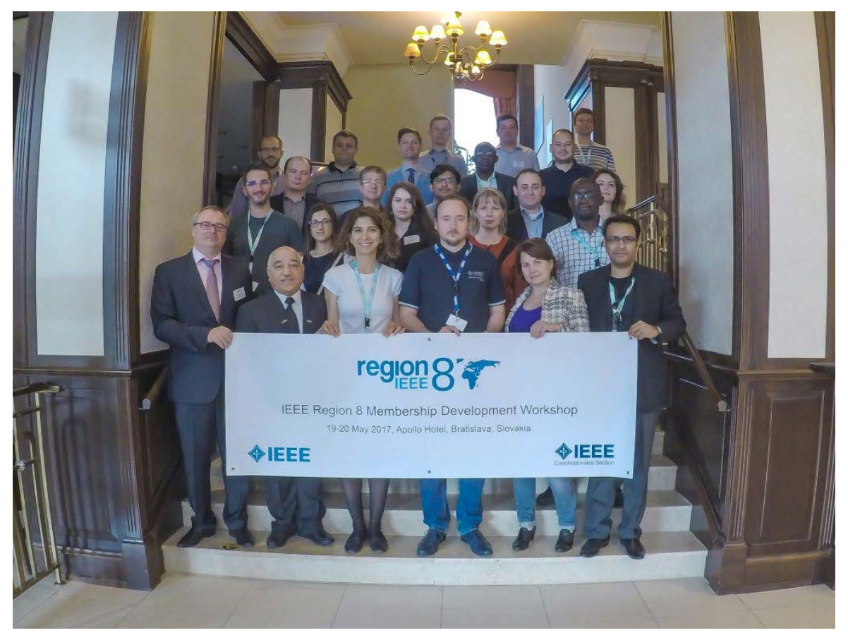
IEEE R8 MDW 2017, Bratislava, Slovakia