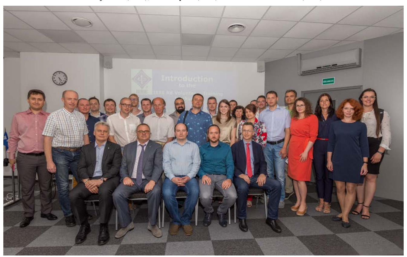
IEEE R8 VLT 2019, Vilnius, Lithuania