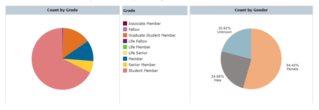
Figure 2 - Membership breakdown by grade and gender

2) Figure 2 shows the breakdown of the current membership by grade and gender. Figure 3 provides an overview of the years of service by member grade.