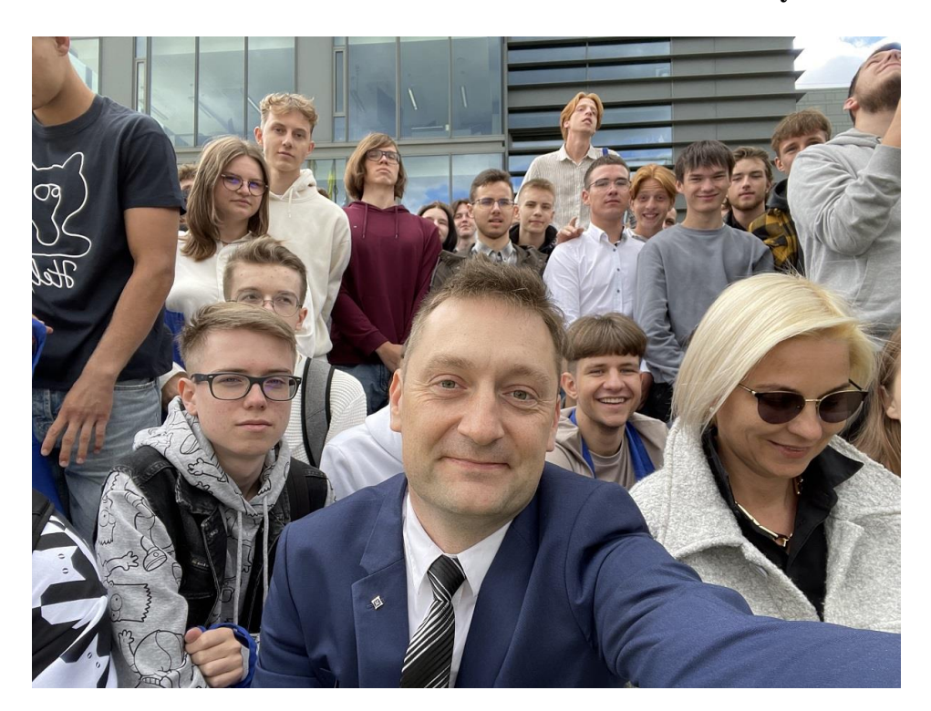
SP-CIS-COM meeting with students