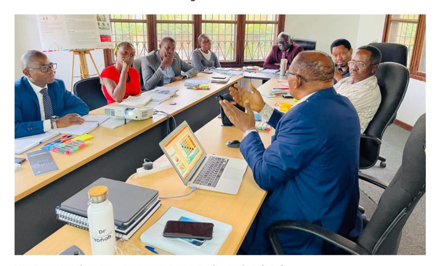
IEEE Tanzania Subsection - Seminar on Power Quality Analysis (PQA)