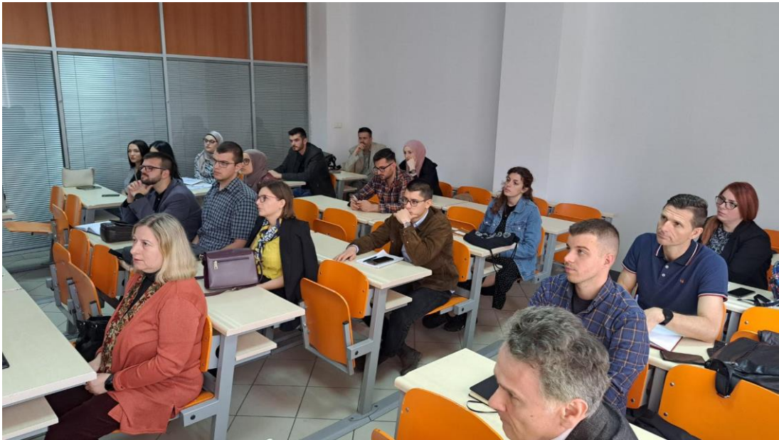
Fig.1. Bosnia and Herzegovina KALCEA YP Training_ 2023