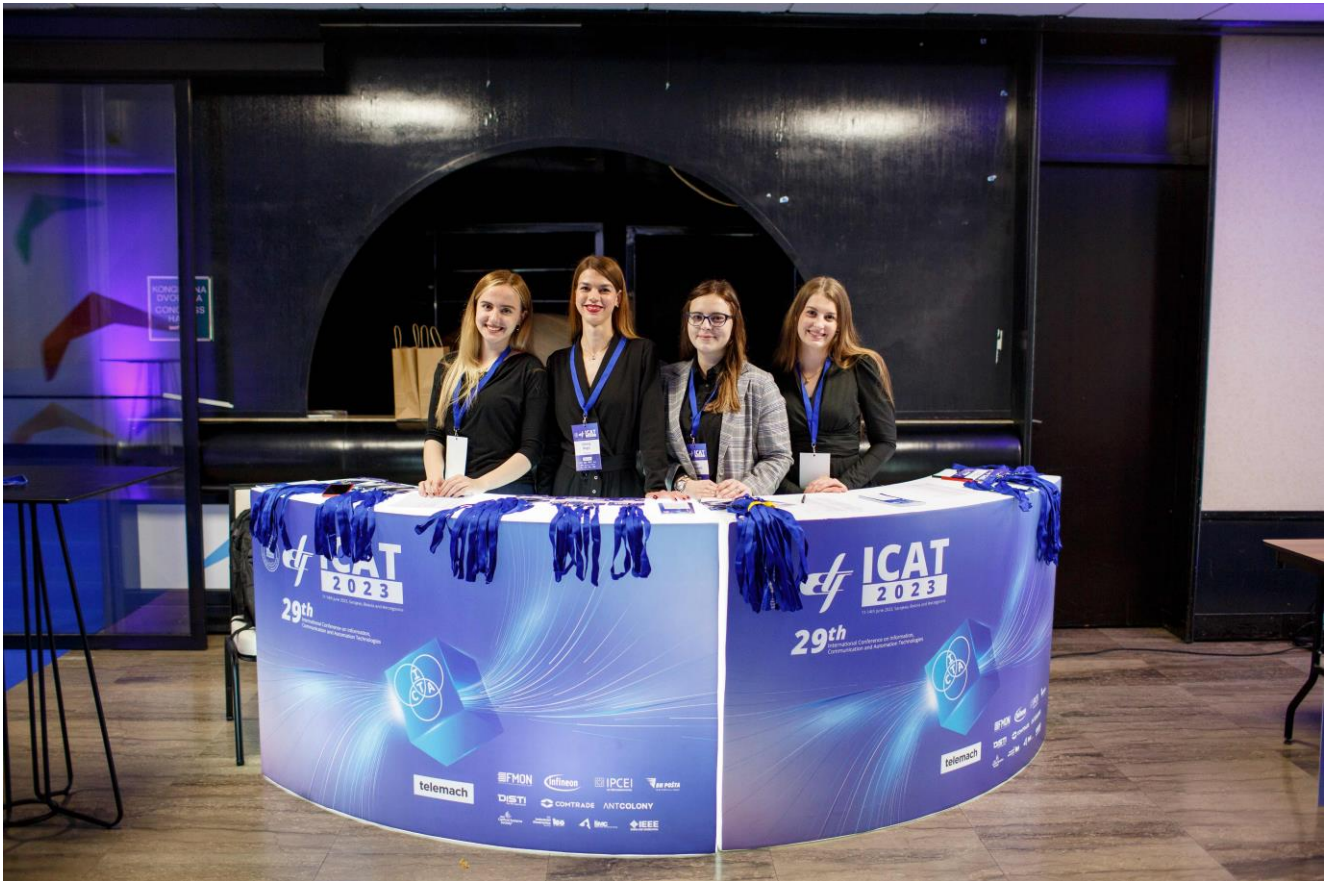
Fig.4. Bosnia and Herzegovina ICAT Conference_2023