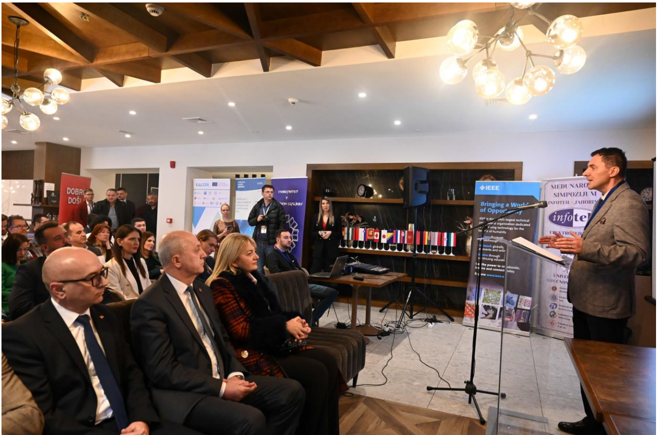
Fig.3. Bosnia and Herzegovina ETRAN Conference_2023

Program of the ETRAN and IcETRAN conference, as a content of one introductory plenary session, five special sessions and 24 regular sessions within three conference days. This year, for the first time, the IcETRAN conference was technically co-sponsored by the IEEE organization, and accepted and presented papers will be published in the digital database IEEE Xplore.