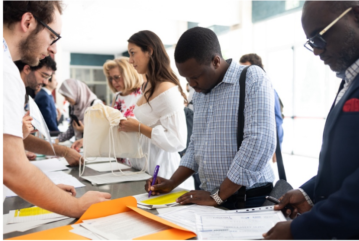
Registration on 6 July 2023