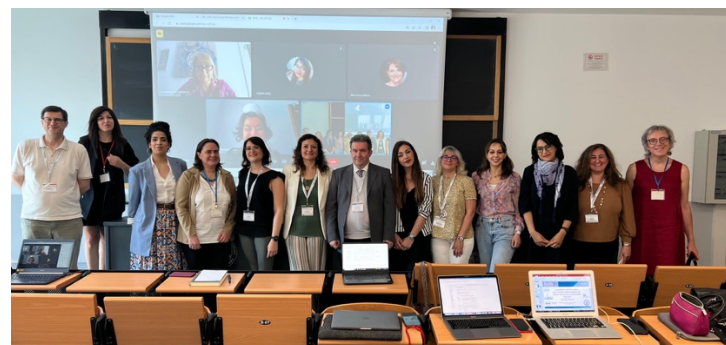
Participants in the WiE event on 8 July 2023