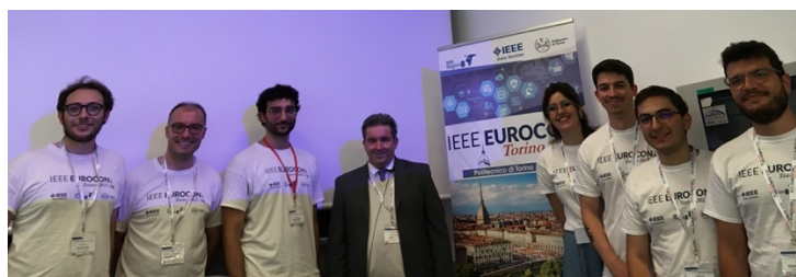
The General Co-Chair and a group of volunteers