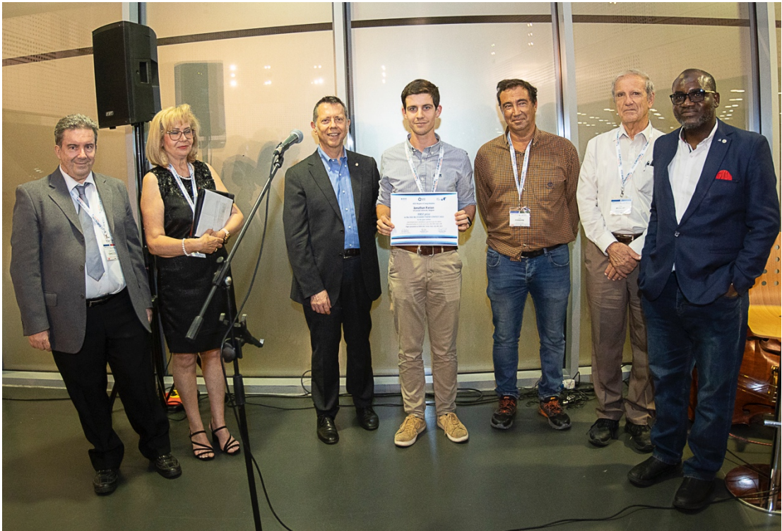
R8 Student Paper Contest Award: the R8 Director, the jury and the winner