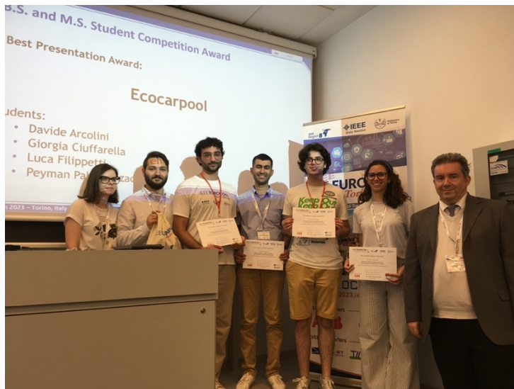
B.S. and M.S. Student competition award – Best presentation