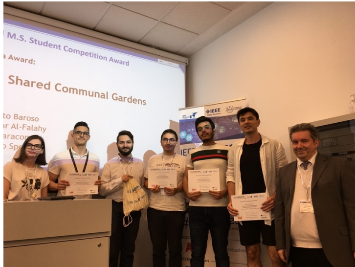
B.S. and M.S. Student competition award – Best idea