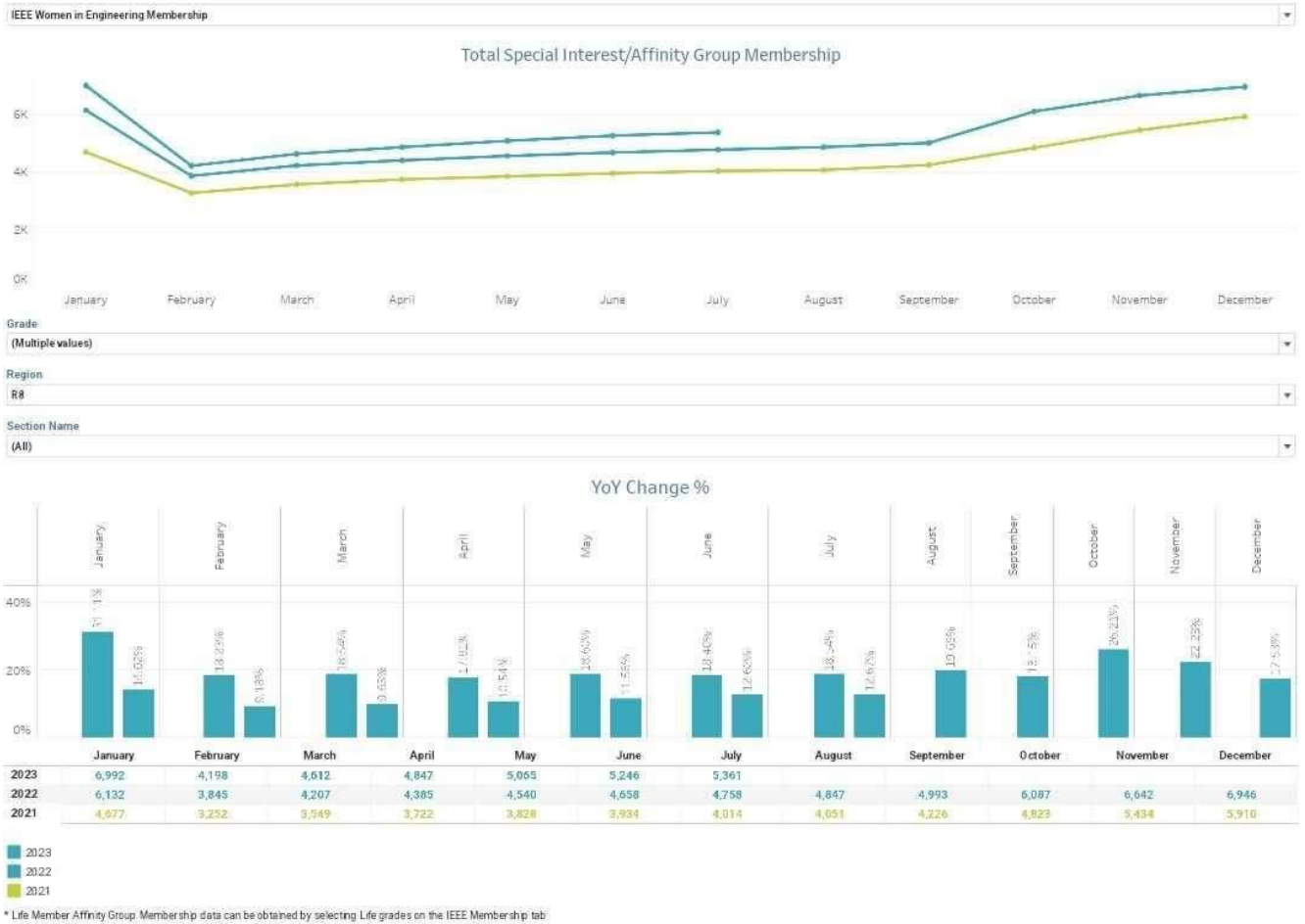
Figure 1 - Membership comparison by month

1) Figure 1 illustrates R8 WIE membership by month over from Jan 2021 to Feb 2023. YoY growth is up by 12,6% in Feb 2023.