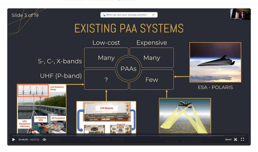
Electrical Engineering Presentation

IEEE FYP Finals - Shared screen with speaker view