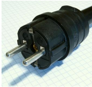
Type C Europlug