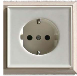
Type C/F socket