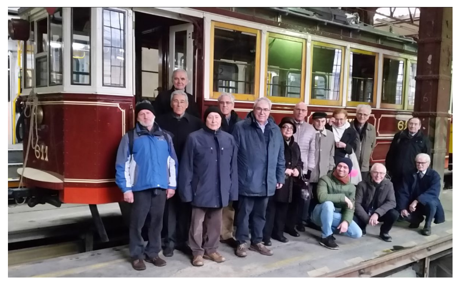
Visit in the Museum of Public Transportation