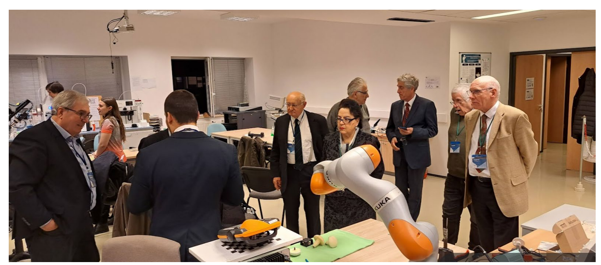
Visit in the OU Research and Innovation Center