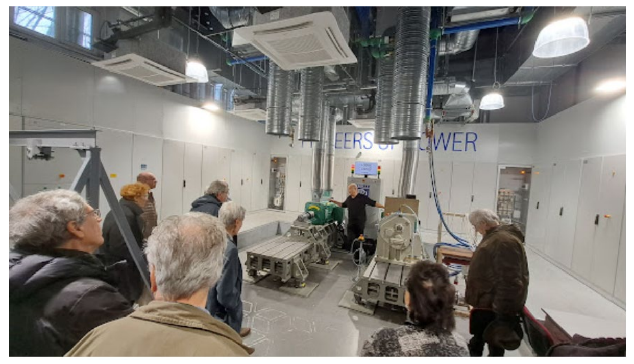
Visit in the BUTE Modular Hybrid Drive System Laboratory