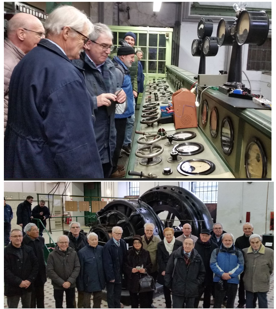
Visit in the Historical DC Substation