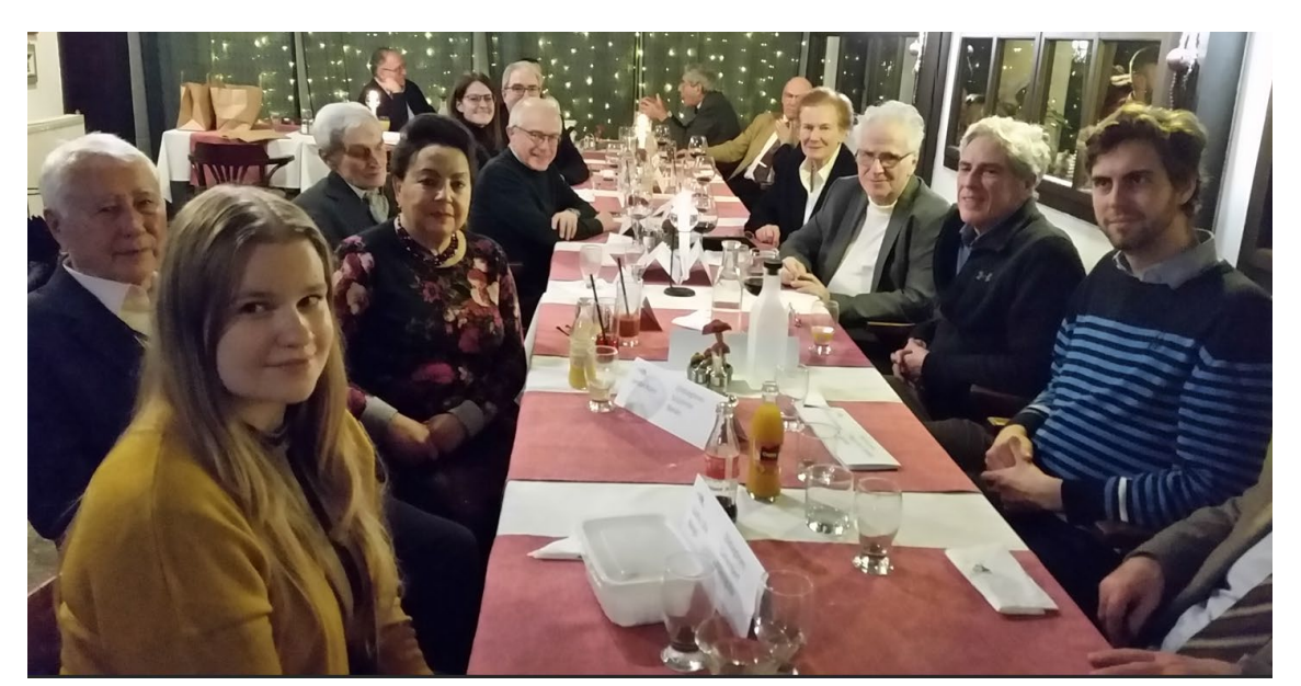
Social Event: Dinner with local Section members and YP members