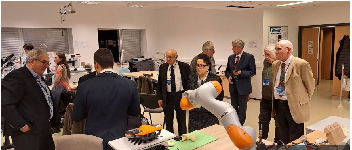
Visit in the OU Research and Innovation Center