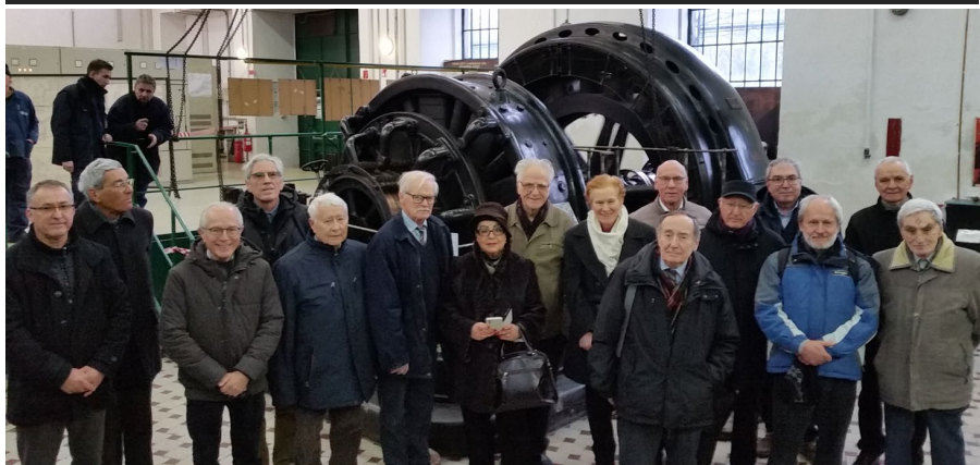
Visit in the Historical DC Substation