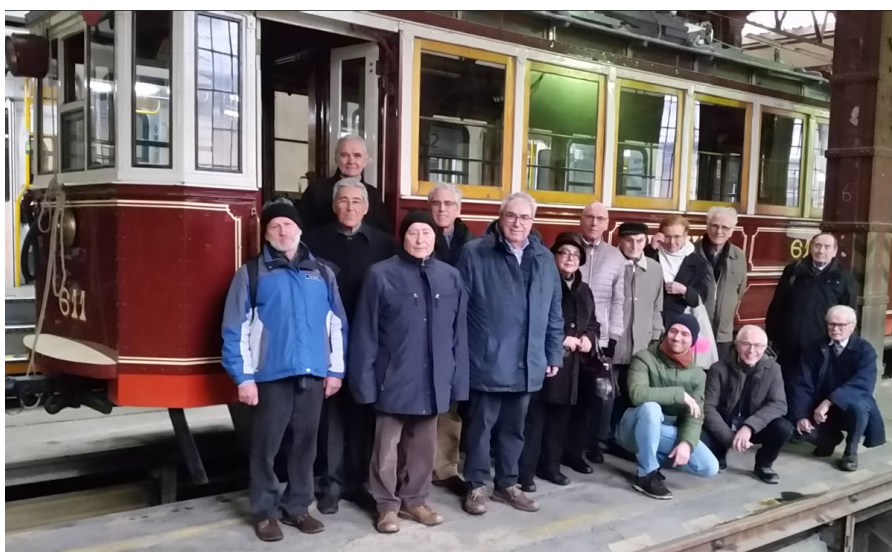
Visit in the Museum of Public Transportation