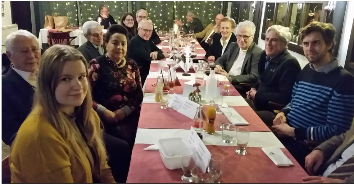
Social Event: Dinner with local Section members and YP members