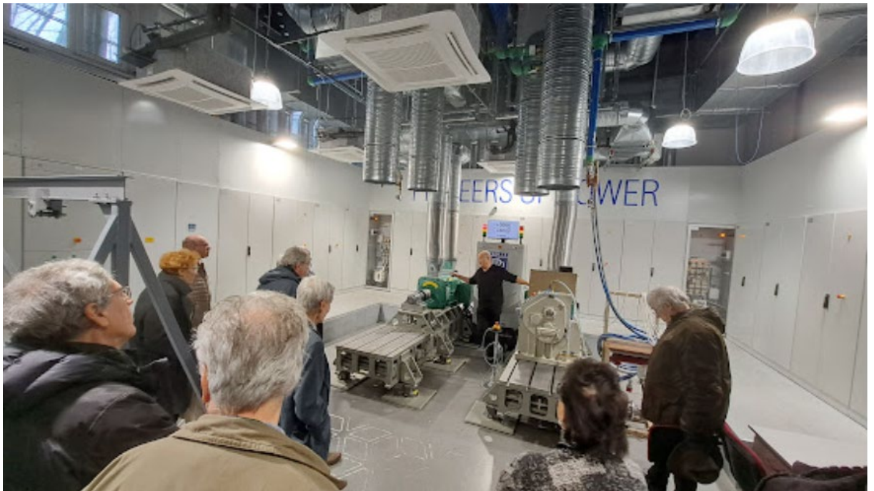
Visit in the BUTE Modular Hybrid Drive System Laboratory