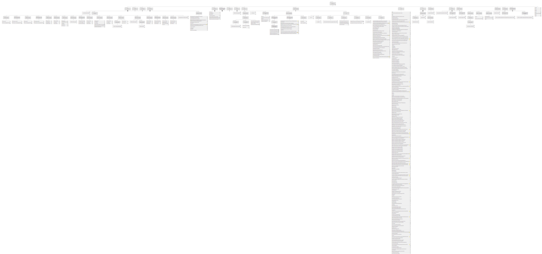
Site map of the current R8 website (for illustration, not meant to be readable)