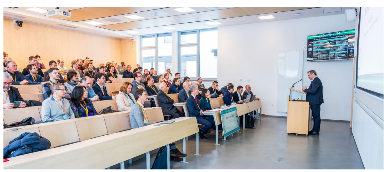
Figure 4: SloChip conference