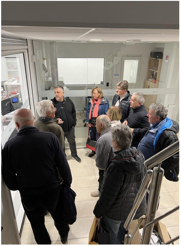
Figure\ 1: A1\ excursion\ (top\ left),\ RedPitaya\ Competition\ (bottom\ left)\ and\ SkyLabs\ excursion\ (right)