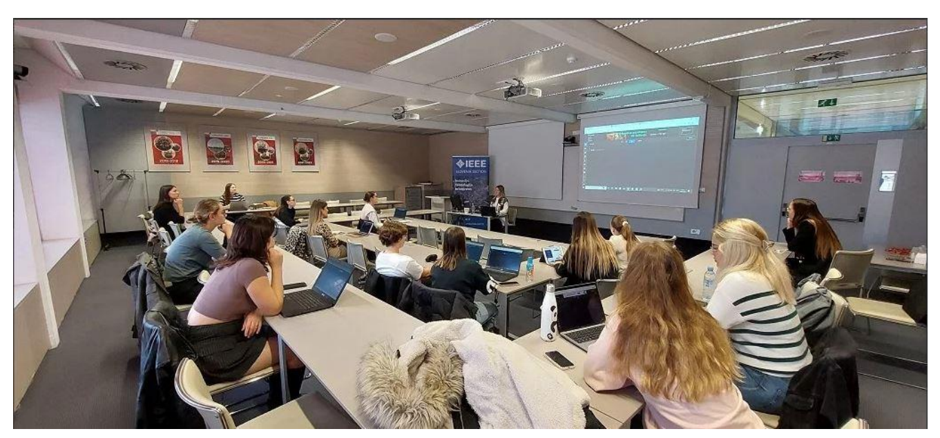
Figure 2: Workshop, computer programming for girls