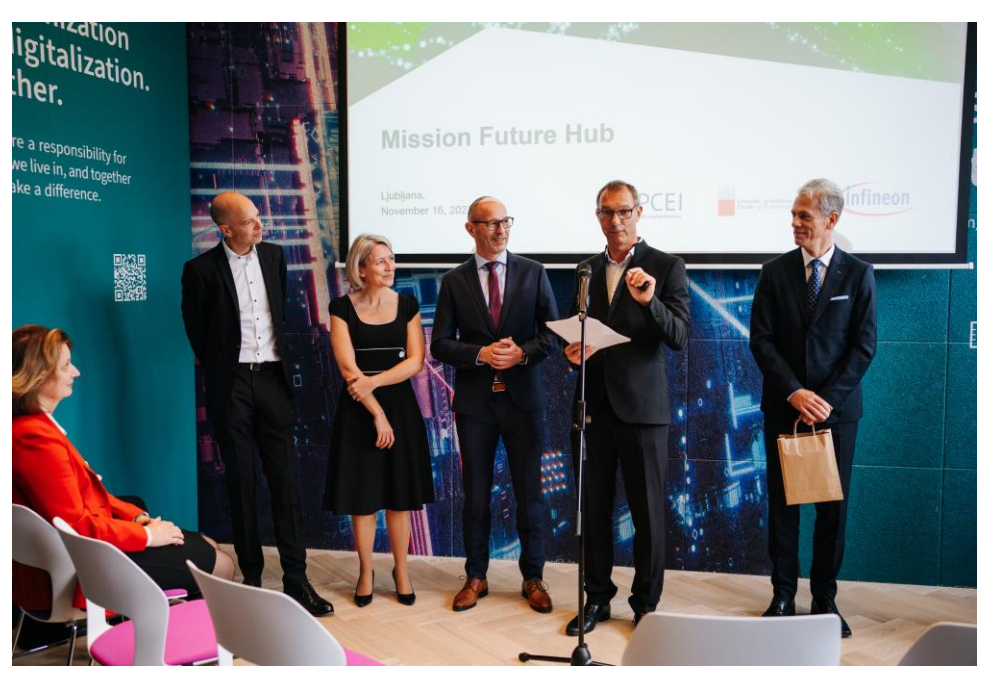
Figure 5: Infineon Mission Hub