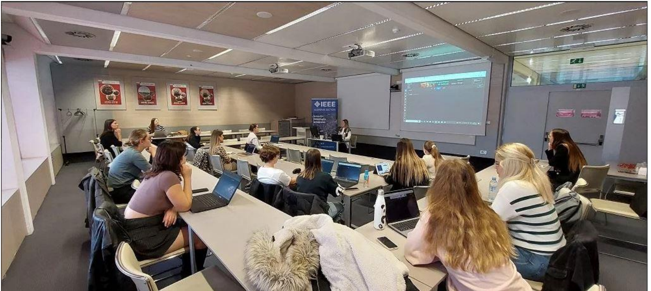
Figure 2: Workshop, computer programming for girls