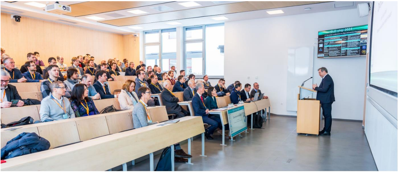
Figure 4: SloChip conference