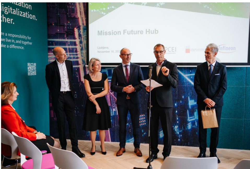
Figure 5: Infineon Mission Hub