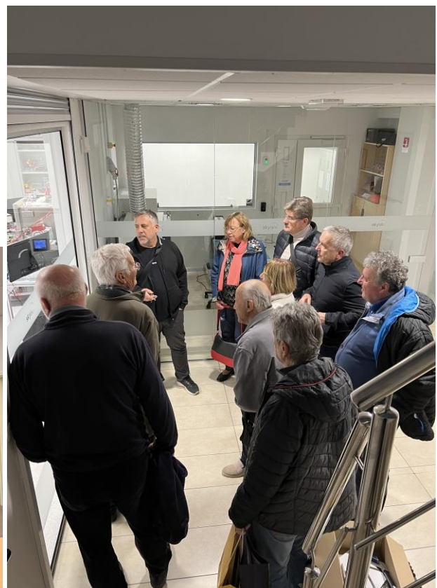
Figure 1: AI excursion (top left), RedPitaya Competition (bottom left) and SkyLabs excursion (right)