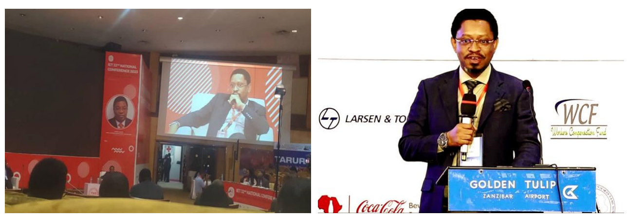
IET WC 8<sup>th</sup> Tanzania Women Engineers Convention and Exhibitions (TAWECE)