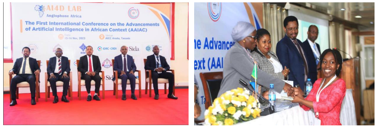
2023 First International Conference on the Advancements of Artificial Intelligence in African Context (AAIAC)