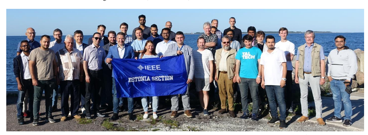
Attendees of the Annual Seminar of the IEEE Estonia Section in Viinistu, Estonia (September 6, 2024)