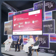
Keynote Speeches and Panel Discussions