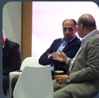
Round Table Discussions