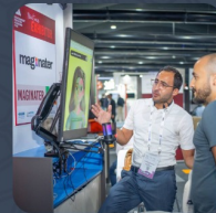
Startups & Smart Cities Challenges

In conjunction with GITEX Africa, the largest technical & startup show in Africa