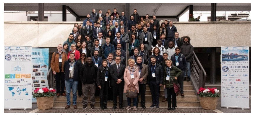
Group photo at the end of the conference with the General Chair, the Organizing Committee, some guests and enthusiastic participants (30 November 2024)

A bright example of cooperation among many IEEE OUs (3 Regions, the organizing local Section, 5 IEEE Societies, 10 Italy Chapters and 2 AG, the IEEE HTB), the R8 Committees: Conference Coordination, Action for Industry, Climate Change, Humanitarian Activities, WIE, YP, SAC) and the local organizing Polytechnic University of Bari, a leading institution fostering dialogue across STEM disciplines, Sustainability and Climate Change issues and Energy Transition. Its location in the Mediterranean basin provided a strategic setting to discuss humanitarian technologies in regions most affected by climate change and socio-economic disparities.