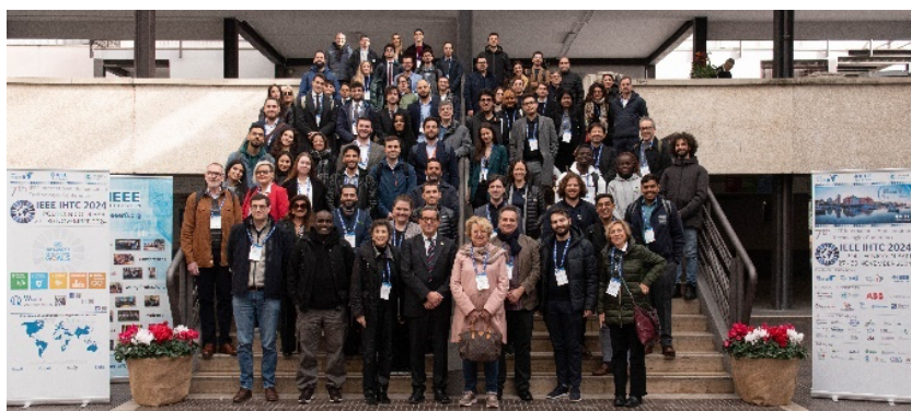
Group photo at the end of the conference with the General Chair, the Organizing Committee, some guests and enthusiastic participants (30 November 2024)

A bright example of cooperation among many IEEE OUs (3 Regions, the organizing local Section, 5 IEEE Societies, 10 Italy Chapters and 2 AG, the IEEE HTB), the R8 Committees: Conference Coordination, Action for Industry, Climate Change, Humanitarian Activities, WIE, YP, SAC) and the local organizing Polytechnic University of Bari, a leading institution fostering dialogue across STEM disciplines, Sustainability and Climate Change issues and Energy Transition. Its location in the Mediterranean basin provided a strategic setting to discuss humanitarian technologies in regions most affected by climate change and socio-economic disparities.