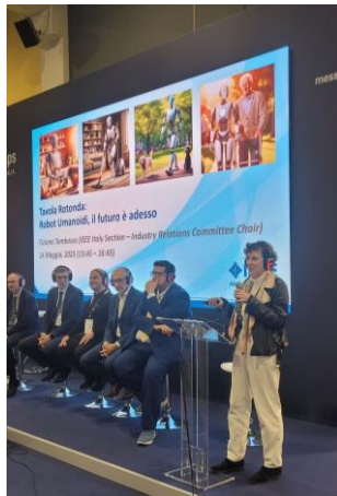
Round table during SPS Italia 2025