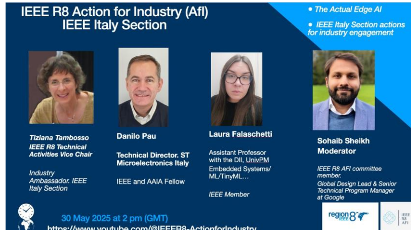
IEEE R8 Afi webinar flyer