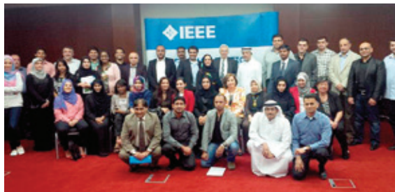
Participants learnt the importance of getting everyone involved