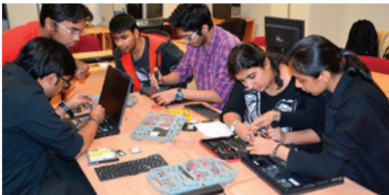
Manipal University, Dubai