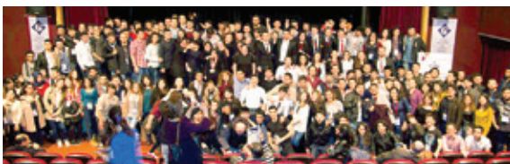
Dogus University, Istanbul