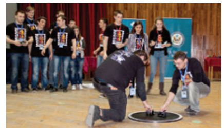
Sumo fights at the finals

The event attracted 23 participants from across Europe (Serbia, Bosnia, Croatia, Montenegro, Slovenia, Turkey, Greece, Hungary, Poland, Spain, Italy, Latvia and